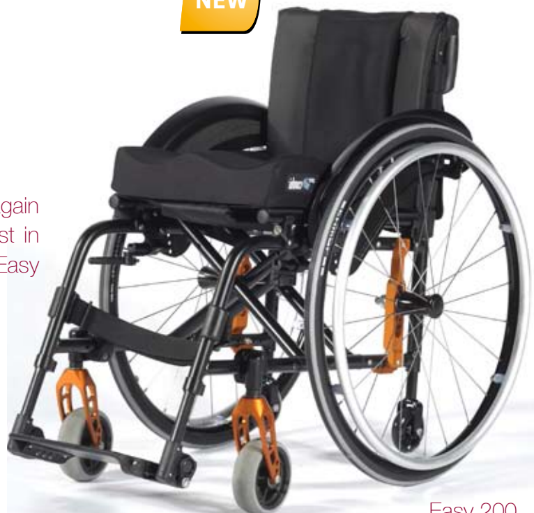
Easy 200 Fixed Front version