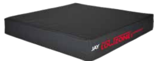
Fully enclosed gel pouch