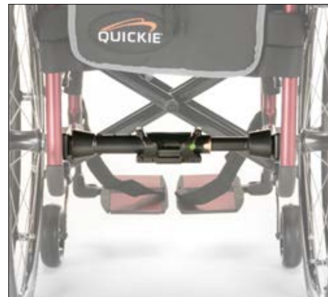
Folding Chair Receiver Bracket and Removable Axle Assembly