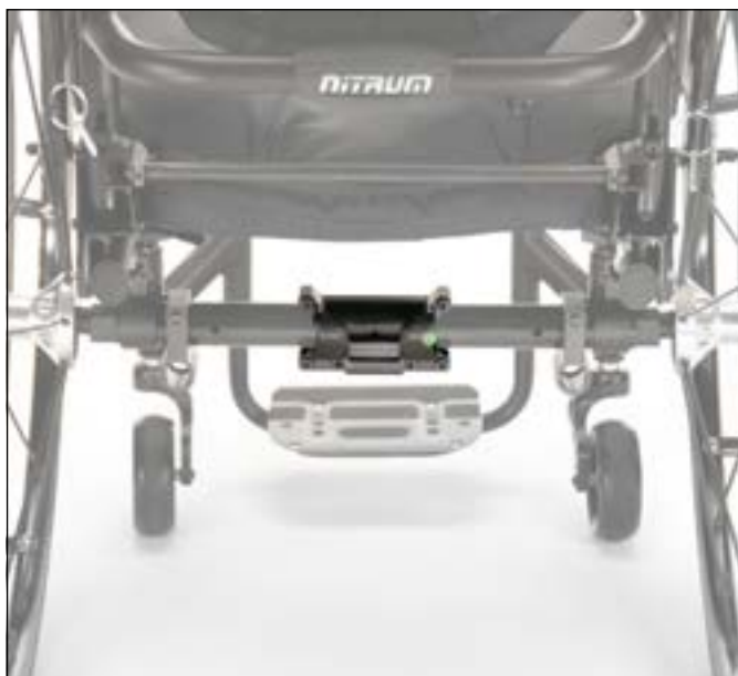
Rigid Chair Receiver Bracket

THE CONTROL BOX can be ordered for either right or left-hand use and can be mounted anywhere on your frame tube.