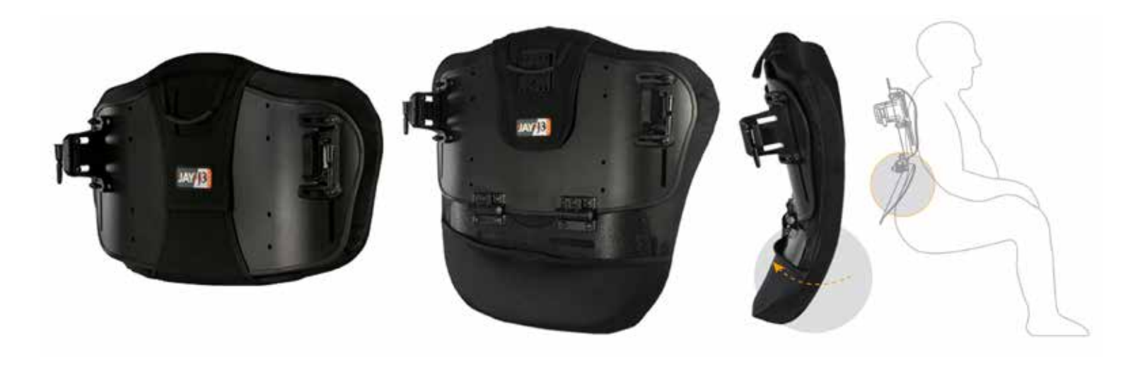
J3™ PLUS Up to 227 kg.