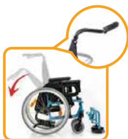
Foldable push handles with ergonomic design