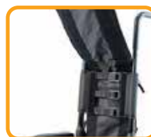
Adjustable velcro straps