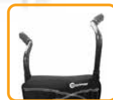
Height adjustable push handles

Parents will appreciate the thoughtful design of easy folding, height adjustable push handles, adjustable armrests and padded adjustable back upholstery