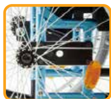
Centre of gravity adjustable