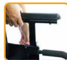
Detachable & height adjustable armrest

Choose Zippie EasyGo for unmatched flexibility and comfort!