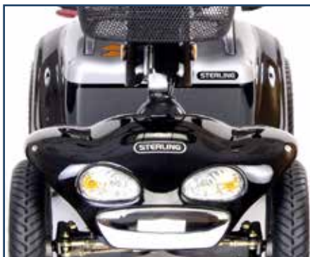
Full lights and indicators package