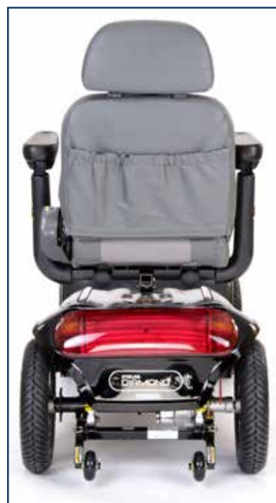
Compact design for easy manoeuvrability

The full suspension chassis offers an exciting ride with great stability. Large wheels and narrow profile tyres offer easy manoeuvrability on all surfaces including rough terrain.