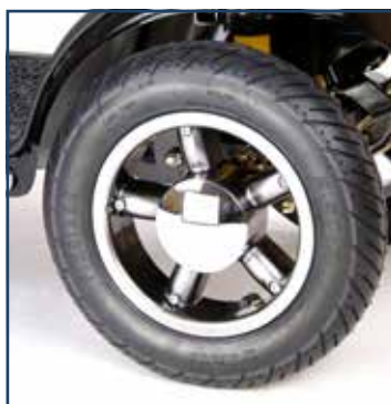
Stylish alloy wheels