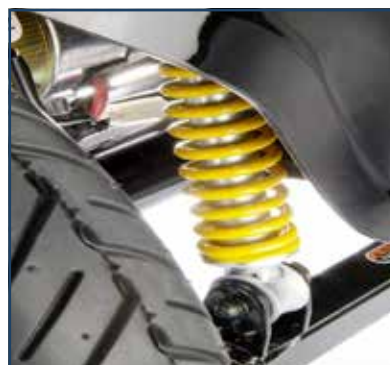
Suspension for added comfort

The full suspension chassis offers an exciting ride with great stability. Large wheels and narrow profile tyres offer easy manoeuvrability on all surfaces including rough terrain.