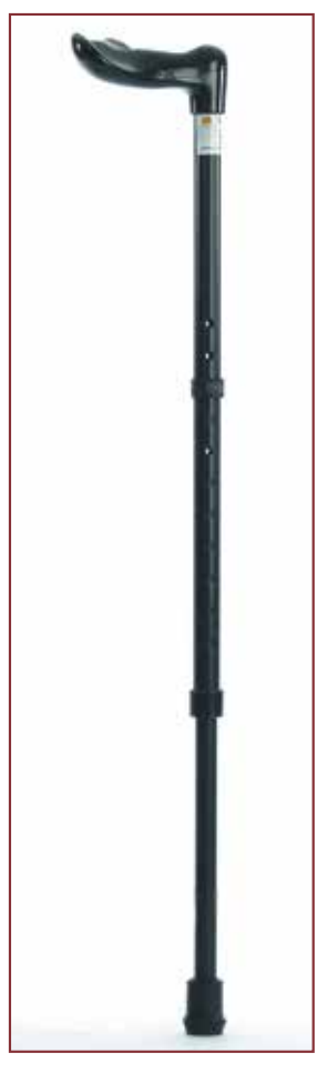
Black Support Sticks – Fischer Stick