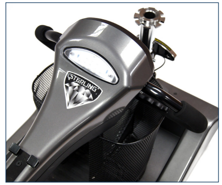
The Sterling Lock system is cable and connector free so there are no fiddly bits to deal with.