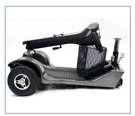
The tiller can be safely secured in position for transporting.