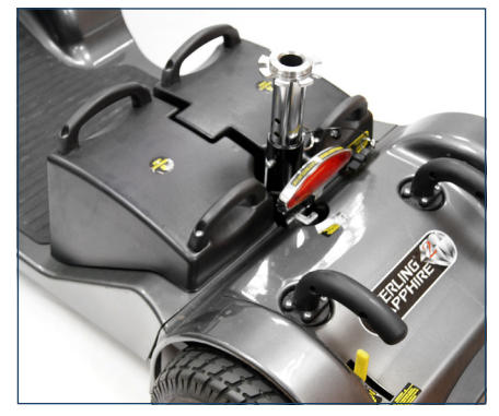
With its large batteries carrying you in style and comfort, the Sapphire 2 is the scooter you'll want to go further on!

Now the Sapphire 2 can be loaded into your vehicle. Luckily, as one of the lightest scooters in its class, this is no problem with the Sterling Lift dual handles fitted to the batteries and rear drive unit. These make lifting and handling the parts safer and more comfortable.