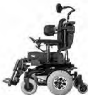
All Terrain Hybrid Design

The Quickie® Xplore 2™ is the most hybrid product available. This wheelchair offers the best of both worlds; the traction of a rear wheel drive and the short turning radius of a mid-wheel drive wheelchair. The fast speed of the Xplore 2™ makes it the ideal choice for someone spending a lot of time outdoors and who wants to go the distance. Safe and comfortable, the 6-wheel independent suspension is offered in Standard and Heavy Duty. The wheelchair come standard with transport brackets. Seat options: tilt, manual and power recline, and elevating seat.