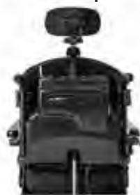
Slim Back Cover