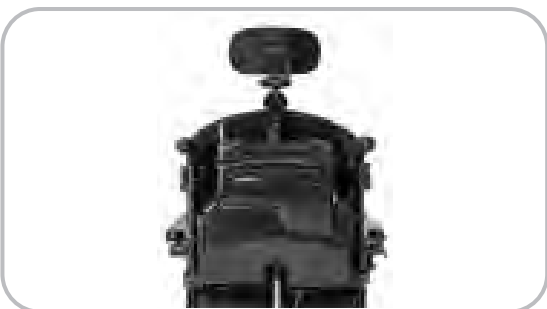
Slim Back Cover