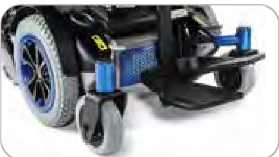
Independent height adjustable footplates