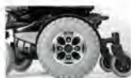
12, 14" or 14x3" Wheel Option