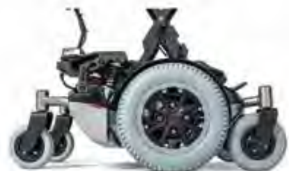
GC3 Suspension technology