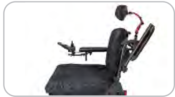
New cantilever armrest opens with 5^{\circ} angle