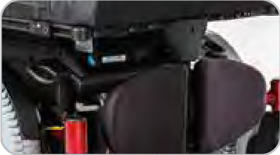
Infinite adjustment center mount -5^{\circ} to 70^{\circ}