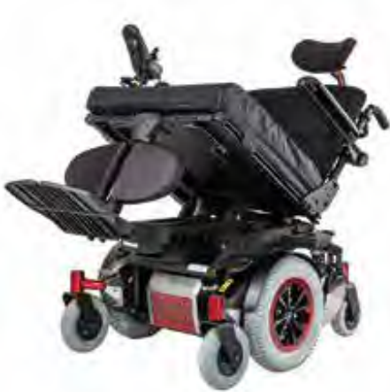
Heavy Duty Tilt

The mid-wheel Heavy Duty Quickie® XCEL 2™ features the Advance Geometric Design (A.G.D) which helps enhance the stability, mobility and freedom for the end user. Engineered without compromise, the XCEL 2™ offers a weight capacity of 249kgs, a bariatric CG power tilt bariatric power recline option, and heavy duty elevating legrests or center mount for the best comfort.