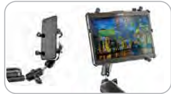
Phone & Tablet Support