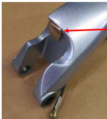
New spring loaded brass pad