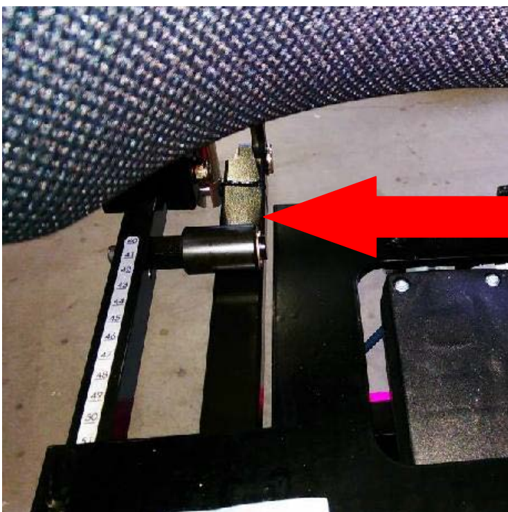
Strengthened square recline armrest linkage tube with a supportive roller for the Jive Up.

With immediate effect we now have the reclining armrest also available for the seat depth settings 48, 50 and 52cm (originally only available up to 46cm). Additionally the linkage tube has been updated as per picture below.