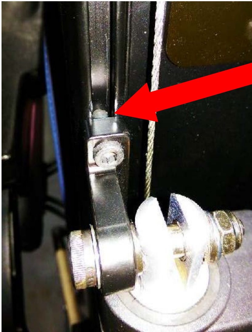
6mm bolt that goes through the Jive Up backrest extrusion structure for increased strength.

We have changed the upper actuator fixing point on the backrest on Jive Up from a channel nut principal to a standard bolt through the backrest extrusion structure. This provides a more solid connection between the actuator and the back structure.