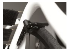
XFF060004 Lightweight compact brake