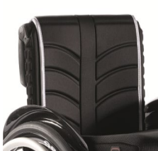
XFF 030316 EXO backrest sling