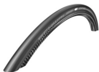
XFF070107 Schwalbe One