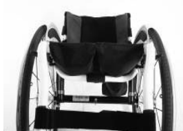
XFF 020003 Seat sling with utility bags 2