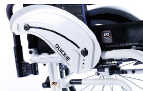
XFF040103 Aluminium, cold weather protection, fender