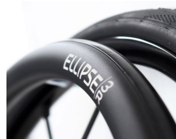
XFF070212 Handrims Ellipse 3R