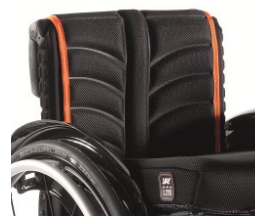
XFF 030317 EXO PRO backrest sling