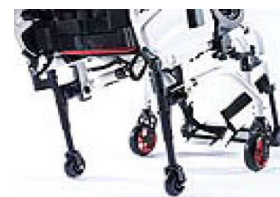
XFF090010 Transit wheels