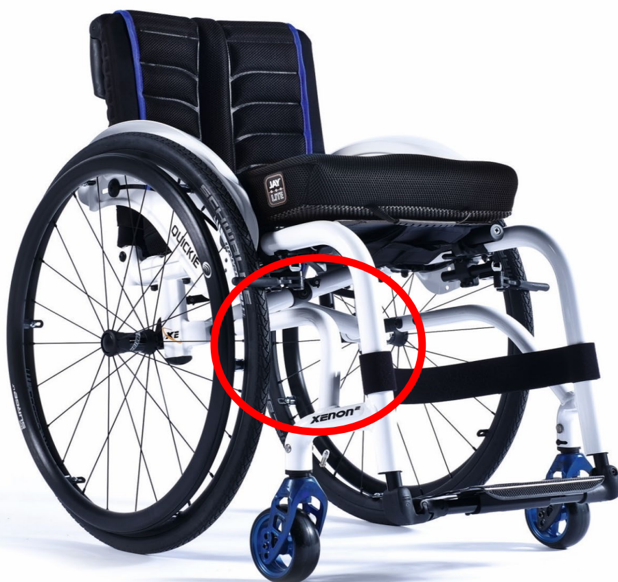
XFF090020 / 21 Hybrid frame