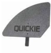
XFF040107 Composite sideguard detachable