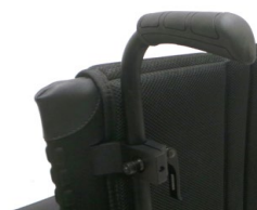
XFF 030204 Push handles, height-adjustable