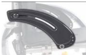
XFF040101 carbon fibre, cold weather protection, slim