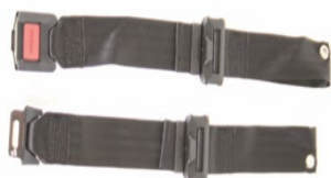
XFF 090018 Lap belt with buckle, metal