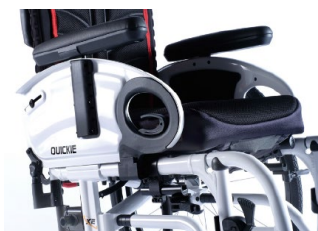
XFF04000x Desk sideguard, armpad, flip-up, removable