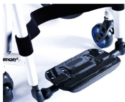
XFF050132 Footboard platform, lightweight, carbon fibre