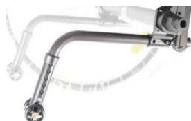
XFF090050 Anti-tip tubes, plug in, pair