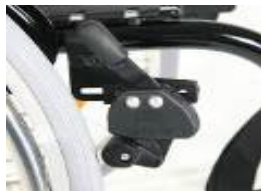
XFF060002 Knee lever brake