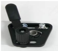
XFF060001 Standard brake