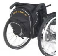
XFF090030 Back pack