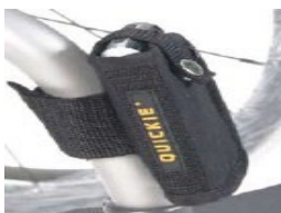
XFF090026 Mobile phone pocket