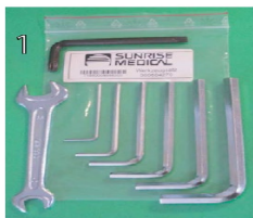
XFF090000 Tool kit