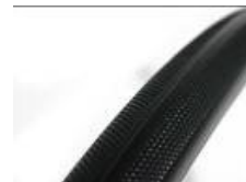
XFF070102 Tyre, puncture proof