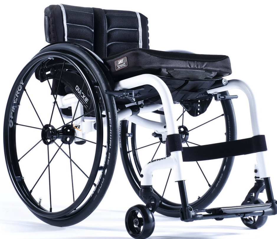
XFF010012 / 13 Open Frame