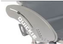
XFF040102 Aluminium, cold weather protection