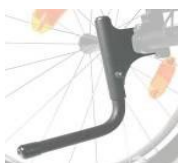
XFF090001 Tip assist