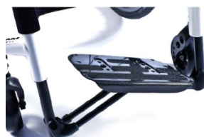
XFF050027 Footboard platform, lightweight, carbon fibre, auto folding