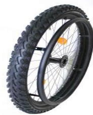
XFF07010 Mountainbike wheel