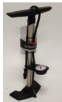
XFF090024 High pressure pump