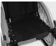
XFF 020002 Seat sling with 1 utility bag