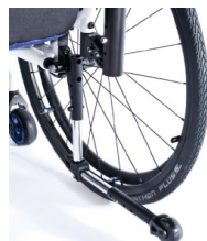
XFF090004 Anti-tip tubes, swing away