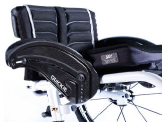
XFF040104 Carbon fibre, cold weather protection, fender