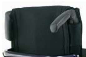
XFF 030203 Push handles, fold-down