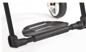
XFF050059 Footboard platform, performance