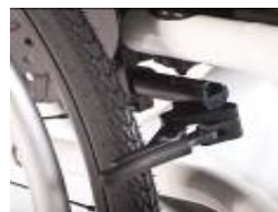
XFF060003 Compact brake