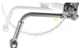
XFF090050 Anti-tip tubes, plug in, pair