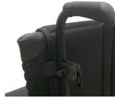
XFF 030204 Push handles, height-adjustable