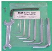
XFF090000 Tool kit