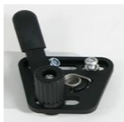
XFF060001 Standard brake