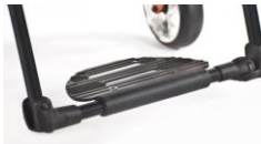
XFF050059 Footboard platform, performance