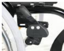
XFF060002 Knee lever brake