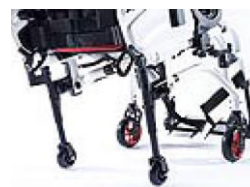
XFF090010 Transit wheels