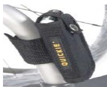
XFF090026 Mobile phone pocket