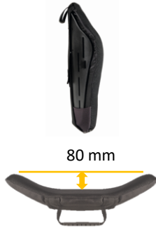
JAY J3 Mid Contour