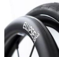
XFF070212 Handrims Ellipse 3R