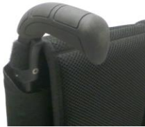
XFF 030201 Push handles long