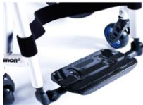
XFF050132 Footboard platform, lightweight, carbon fibre