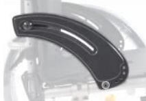
XFF040101 carbon fibre, cold weather protection, slim