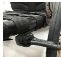
XFF060024 Lightweight compact brake EVO