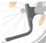
XFF090001 Tip assist