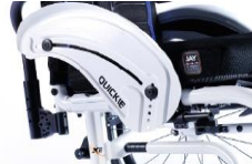
XFF040103 Aluminium, cold weather protection, fender