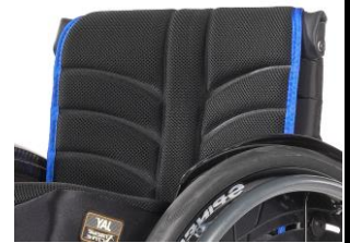
XFF 030317 EXO PRO backrest sling (EXO Evo version)