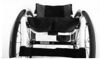
XFF 020003 Seat sling with utility bags 2