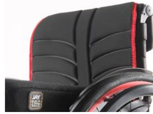
XFF 030316 EXO backrest sling (EXO Evo version)