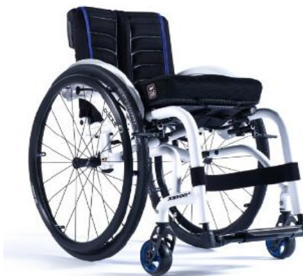
XFF090020 / 21 Hybrid frame