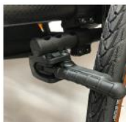
XFF060023 Compact brake EVO