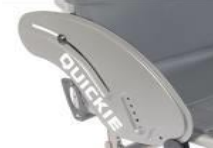
XFF040102 Aluminium, cold weather protection