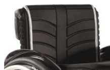
EXO backrest sling