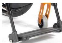
Footboard, platform, lightweight, plastic, angle & depth- adjustable flip up (sideways), calf strap, black