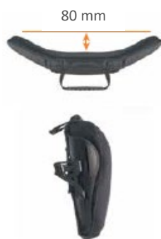
Jay 3 Back Mid Contour