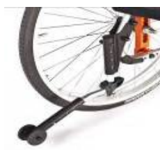
Anti-tip tubes, swing- away, left