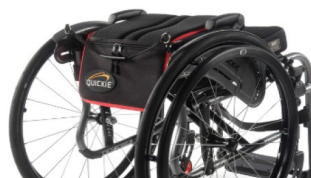
Backrest, fold down (to the front)