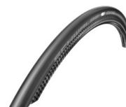
Tyre, pneumatic, slick, Schwalbe One