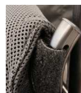
Without push handles,