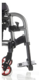
Aluminium hanger, 90°