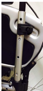
Backrest tube, aluminium