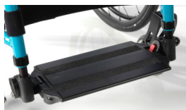
Footboard, angle and depth adjustable; flip up, aluminium with locking system