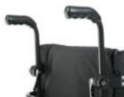
Push handles, height-adjustable