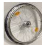
Rear wheel, drum brakes, 36 spokes, cross- wise spokes