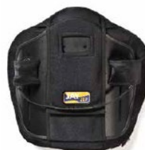
Jay Zip Back