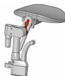
Amputee Support Pad