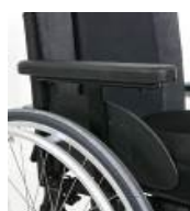
Single-post sideguard, armpad, height-adjustable, remove