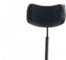
Headrest, height, depth and angle adjustable