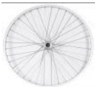
Rear wheel, Universal, 36 spokes, cross-wise spokes