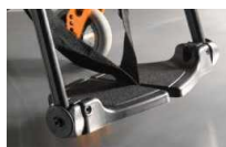
Footboard, divided, composite, angle- adjustable, flip-up (sideways), heel loop, black