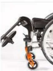
Elevating legrest (ELR)