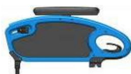
Desk sideguard, armpad, fixed, flip-up, remove