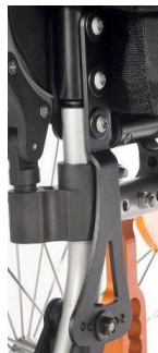
Backrest, angle adjustable