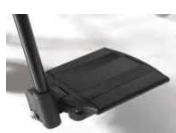
Footboard, divided, aluminium, angle- adjustable, flip-up (sideways), heel loop, black