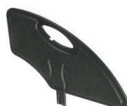
Composite sideguard, removeable (black)