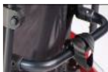
Stabilizer bar, automatic folding