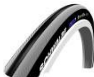
Tyre, pneumatic, fine profile, Schwalbe Right Run