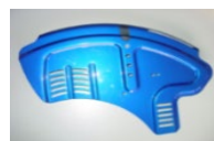
Aluminium sideguard, fender, wet weatherprotection (in frame colour)