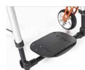
Footboard, platform, lightweight, plastic, angle & depth-adjustable flip up (sideways), calf strap