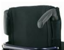
Push handles, fold-down