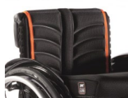
EXO PRO backrest sling