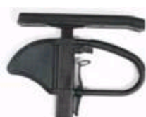
Single post height adjustable