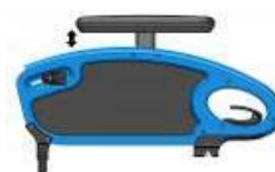
Desk sideguard, armpad, height-adjustable, flip-up, remove