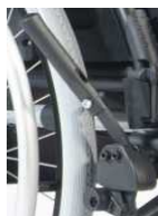
Push to lock brake, one- arm, right actuation