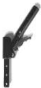
Backrest, half folding (to the back)