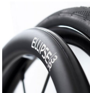
Ellipse 3R Handrim