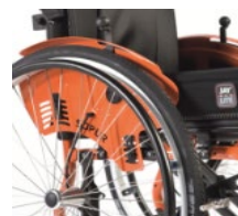
Push to lock brake, integrated in sideguard, Safari