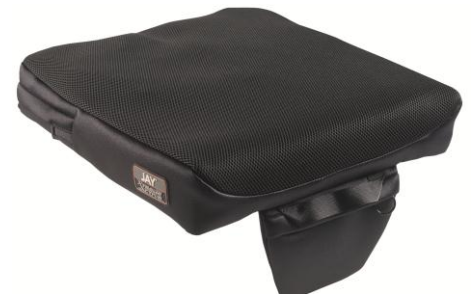
(New: JAY Xtreme Active Microclimatic Cover)