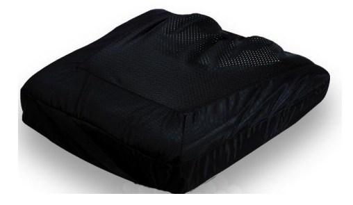
(Old: JAY Xtreme / JAY Active Cover)

The cushion cover also features a pouch for use by the cushion user.