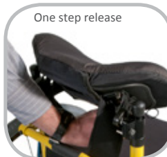
One step release