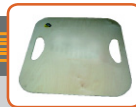
Applewood solid seat (option)