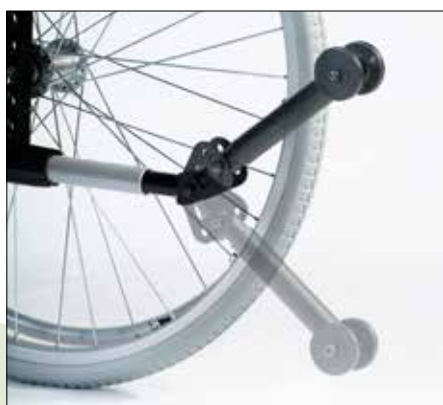
Anti-tips (swing-away, adjustable)