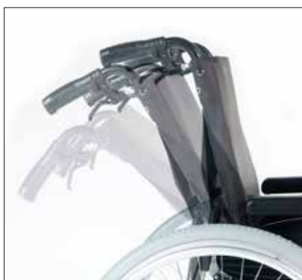
Reclining back (30° infinite adjustable)