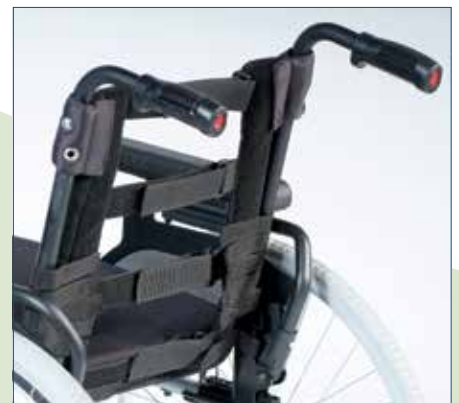
Tension adjustable four strap backrest extendable from 41 - 46cm.