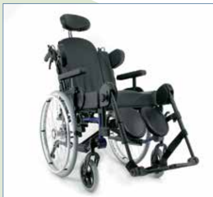
Comfort seat and reclining back (option) for increased sitting tolerance.