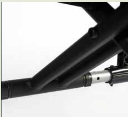
New robust three arm cross brace.