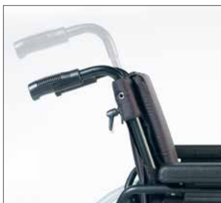
Height adjustable push handles

The X Family 2 comes with a wide range of options, settings and adjustments.