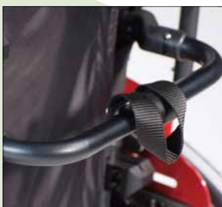
Foldable stabiliser bar