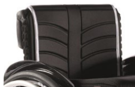
EXO backrest sling