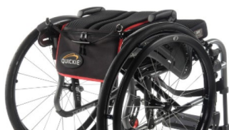
Backrest, fold down (to the front)