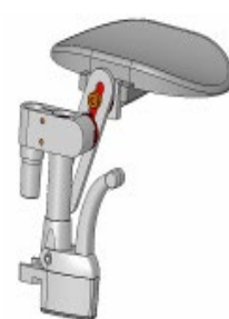
Amputee Support Pad