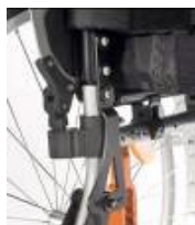
Angle adjustable back -12° to 12°